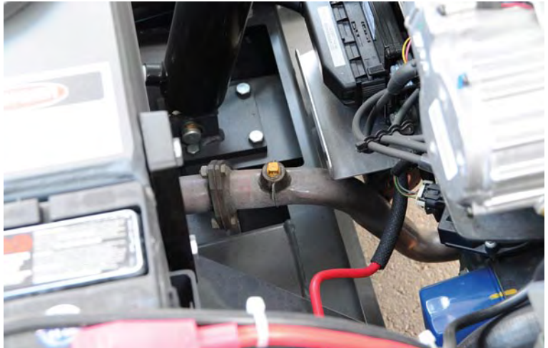
SAMPLING PROBE INSERTED INTO THE ENGINE OUTLET

Toxic gas emissions can be controlled by applying a maintenance program for all components, particularly those for the systems involved in combustion (ignition, air and electrical supply, engine cooling, etc.). A competent mechanic must perform, based on best practices, carburetion maintenance and adjustment and combustion gas analysis.