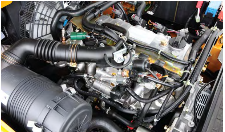
ELECTRONIC CONTROL UNIT (ECU)

The ECU is a microprocessor that controls several components (injectors, sensors, throttle valve, etc.) in order to obtain balanced combustion. The O_2 sensors adjust and maintain the richness of the mixture (air-fuel stoichiometric ratio) for the vehicle's performance and to reduce the toxic gases emitted. The gases are then treated by the catalyst, which reduces the amount of CO and HCs emitted. If it is a 3-way catalyst, it also reduces the NO_x .